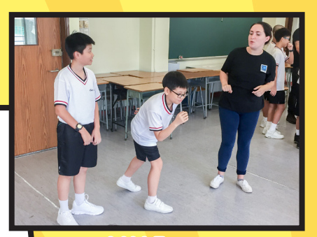
Add A Freeze

At the end of the day, students were overwhelmed with joy and satisfaction despite the amount of activities they had actively participated.