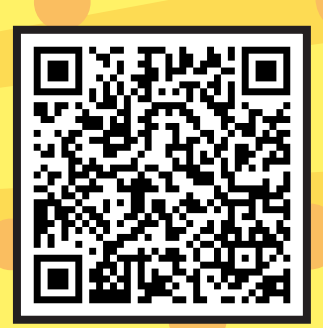
Recap of the show (QR code)