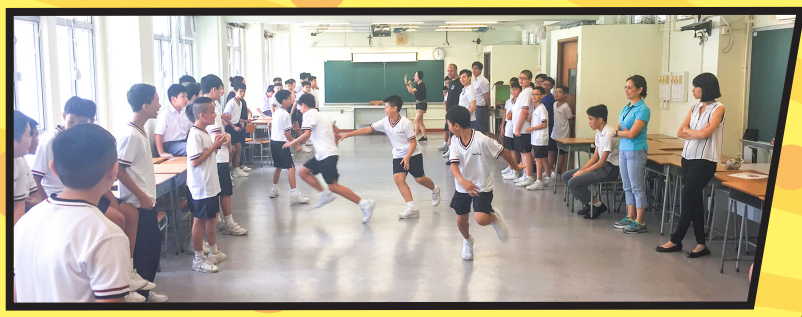
Crossing the river